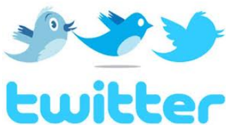
Panel 2 – Social Media Networking Site - Twitter